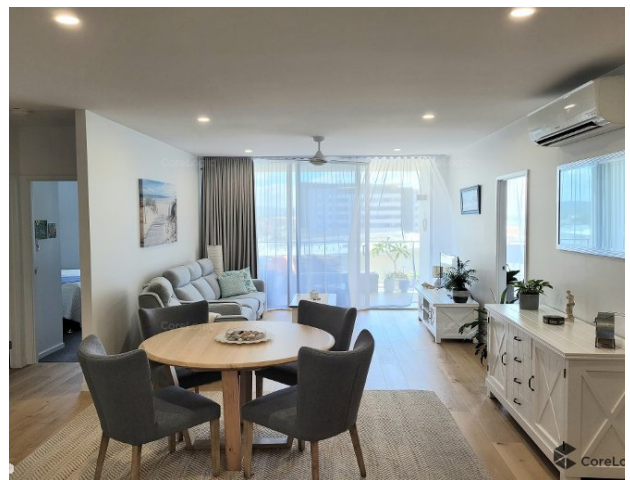
Palm Beach $1,170,000 403/10 Third Ave