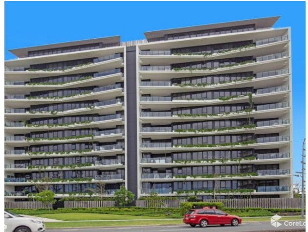
Palm Beach $997,500 2602/1328 Gold Coast Hwy