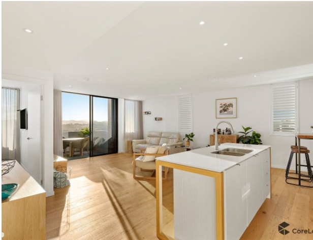
Palm Beach $1,110,000 706/60 Jefferson Lane