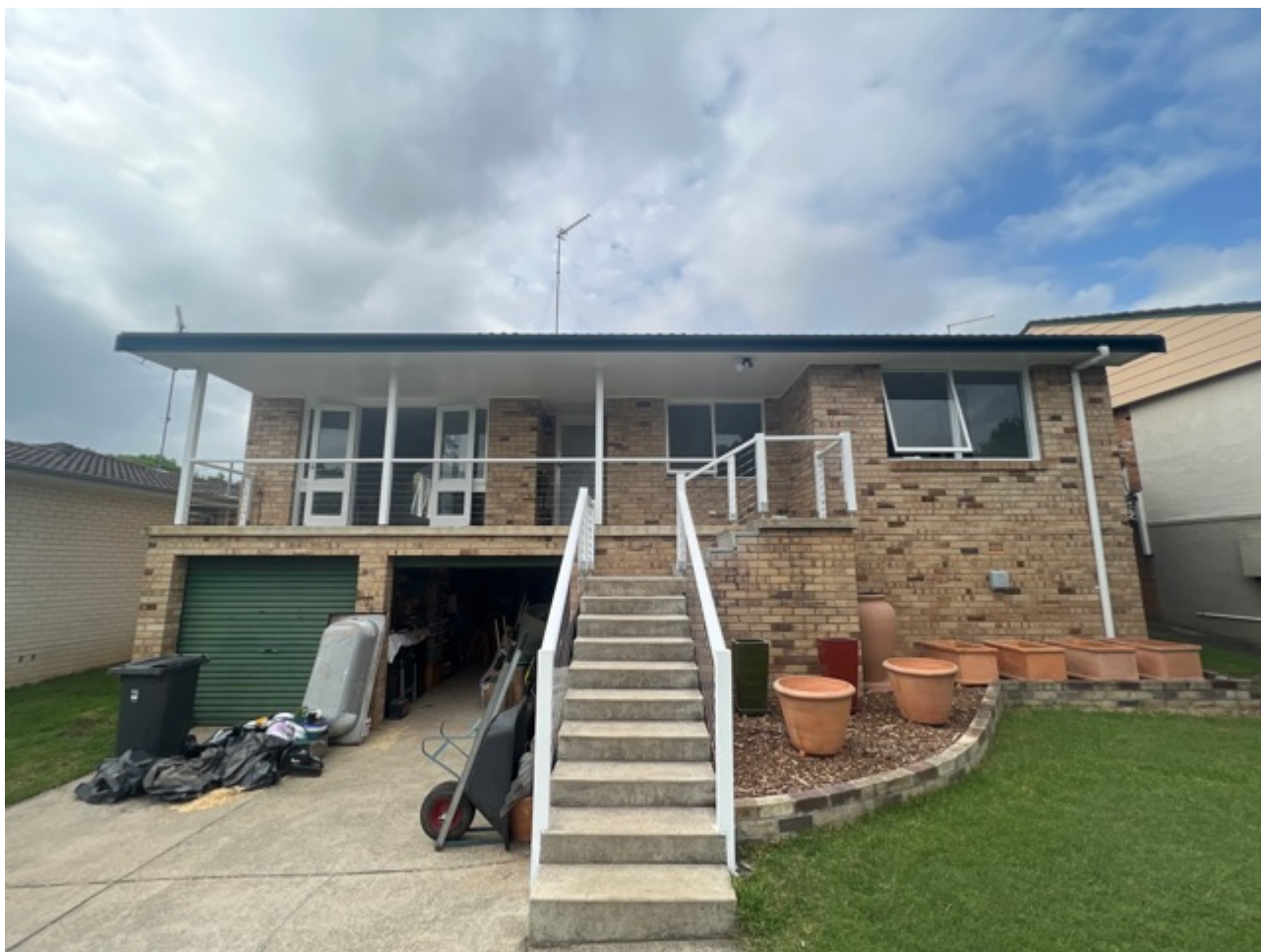
24 JAMES RUSE CLOSE WINDSOR

Front Elevation of the Inspected Property inspected.