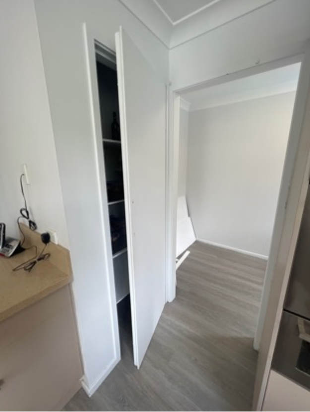
The linen cupboard requires door hardware.