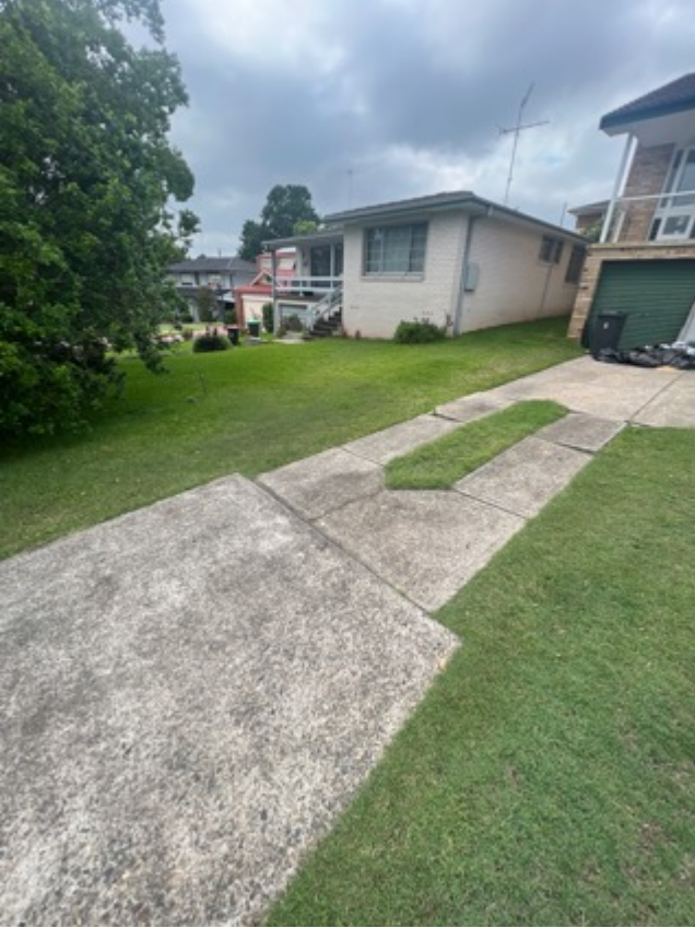
Sections of external concrete is lipped and cracked - other areas are in serviceable condition.