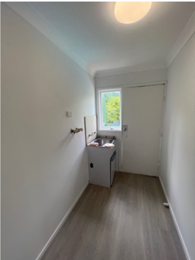
The laundry is in serviceable condition.