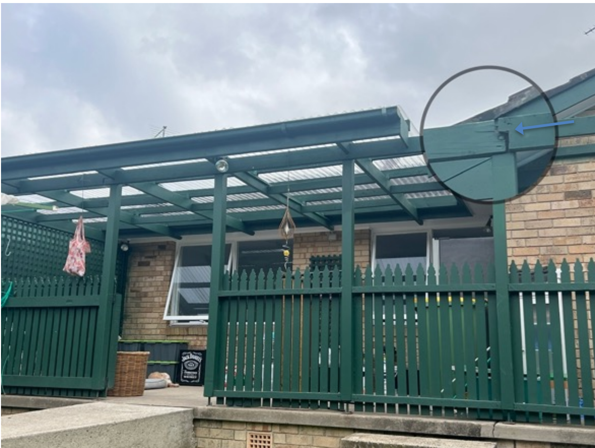
Sections of external timber is weathered - typical for the age.