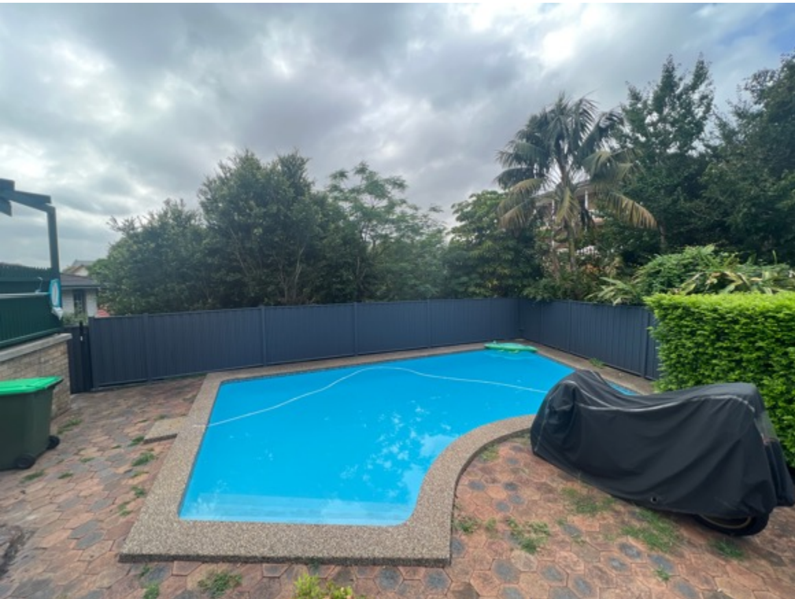
Site fences are in serviceable condition.