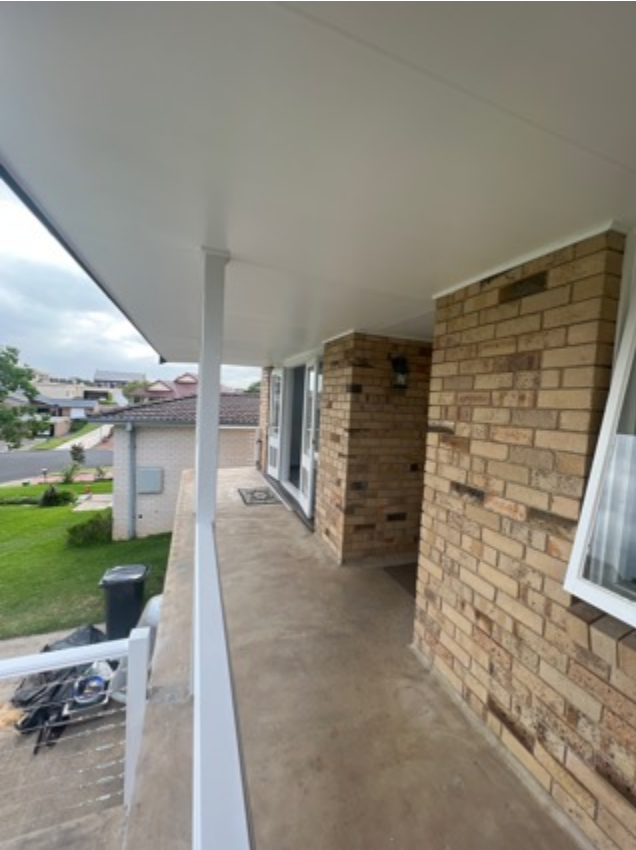
External surfaces have sufficient paint coverage, recently completed (example soffits.)