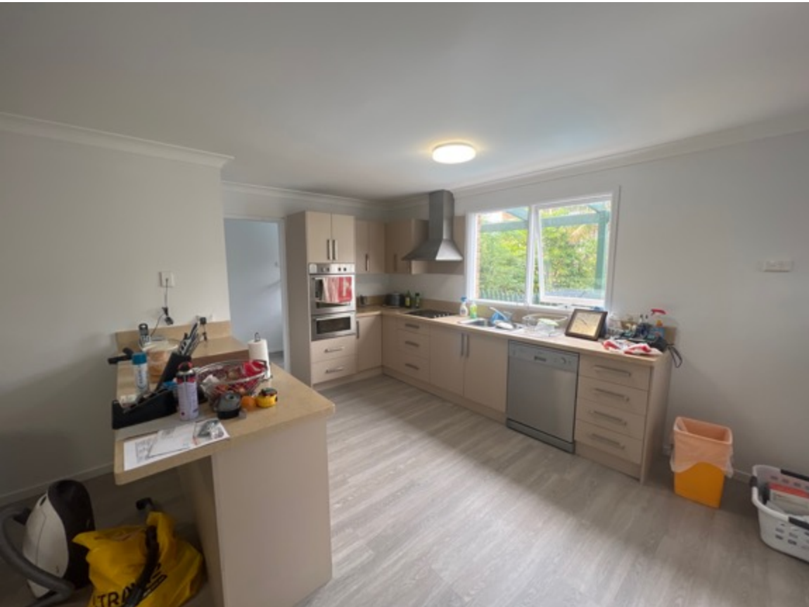
The kitchen presents in satisfactory condition for the age.