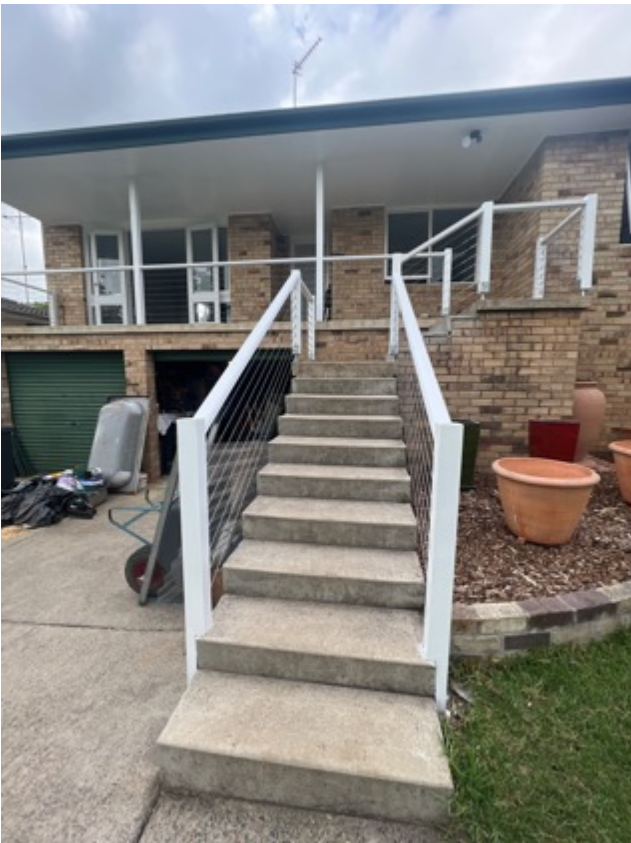
External railings and the rear pergola checked are structurally sound.