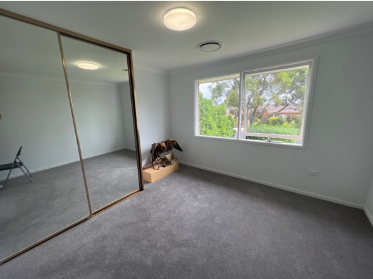
Example front facing main bedroom area above.