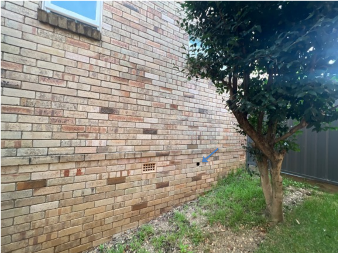
One right side elevation brick has a hole here.