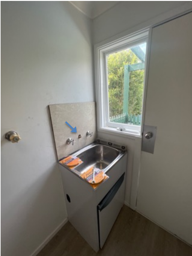
Water services tested, function as intended - the laundry tub tap is missing.