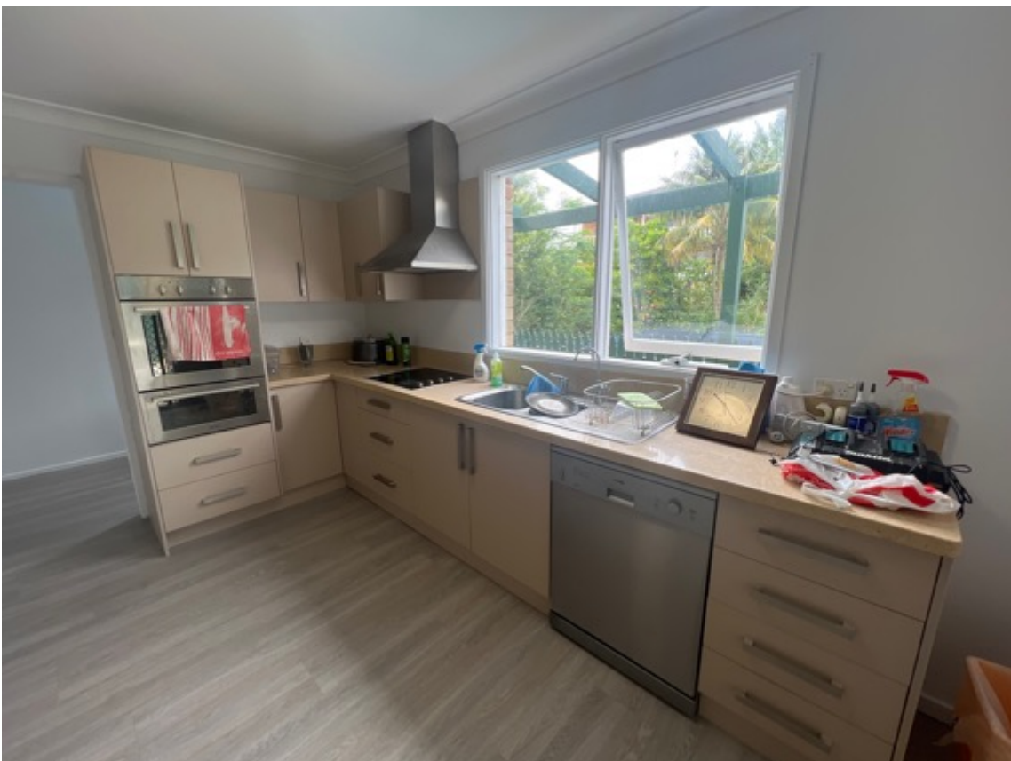
Water pressure tested, is sufficient.