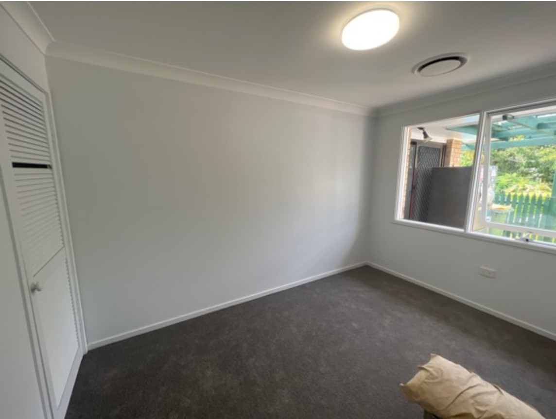
Internal lights tested, function as intended.