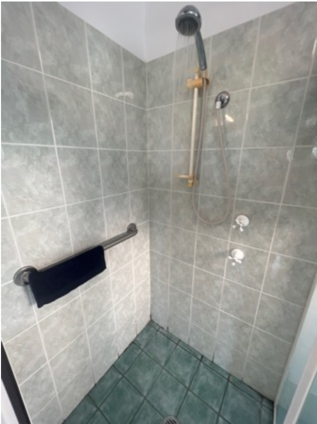
The shower tested, functioned as intended.