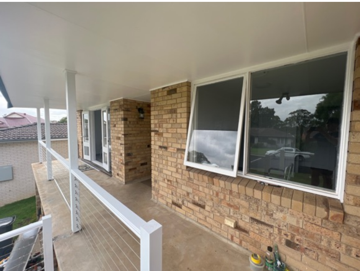
External windows and doors present in satisfactory condition for the age.