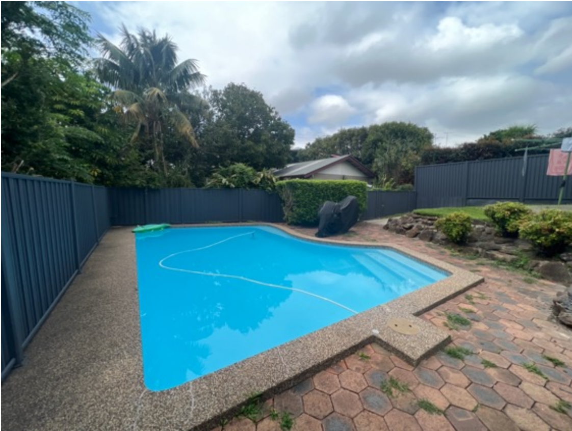
The pool area presents in satisfactory condition.