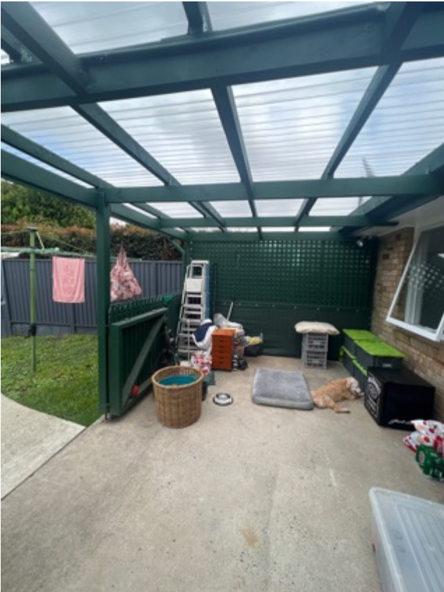
Example rear pergola above.