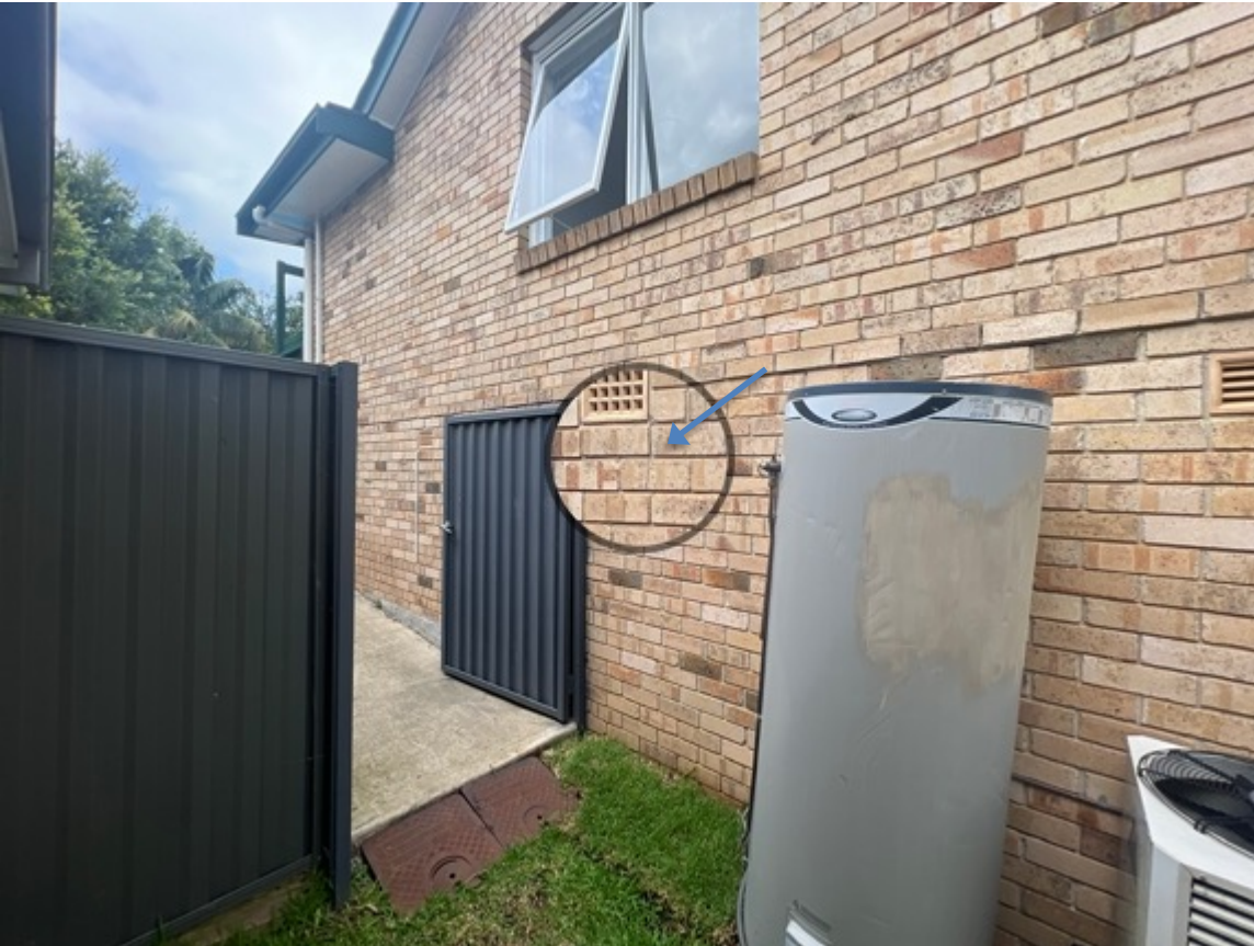
External brickwork has some category one cracking on the left elevation near the side access gate.