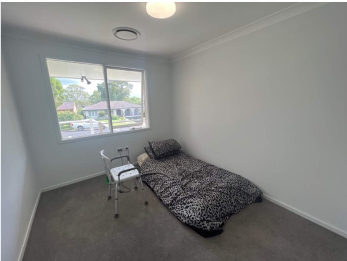
Internal bedrooms present in satisfactory condition for the age.