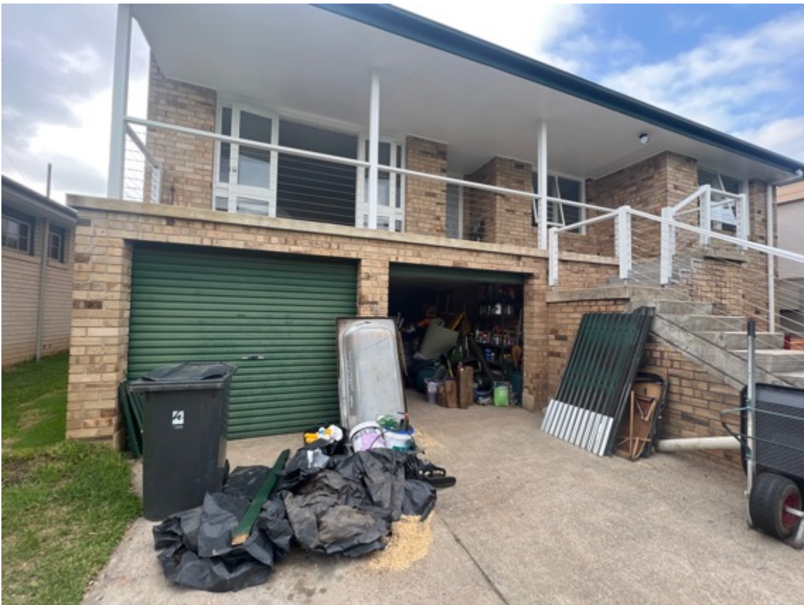
External roller doors tested, function as intended.