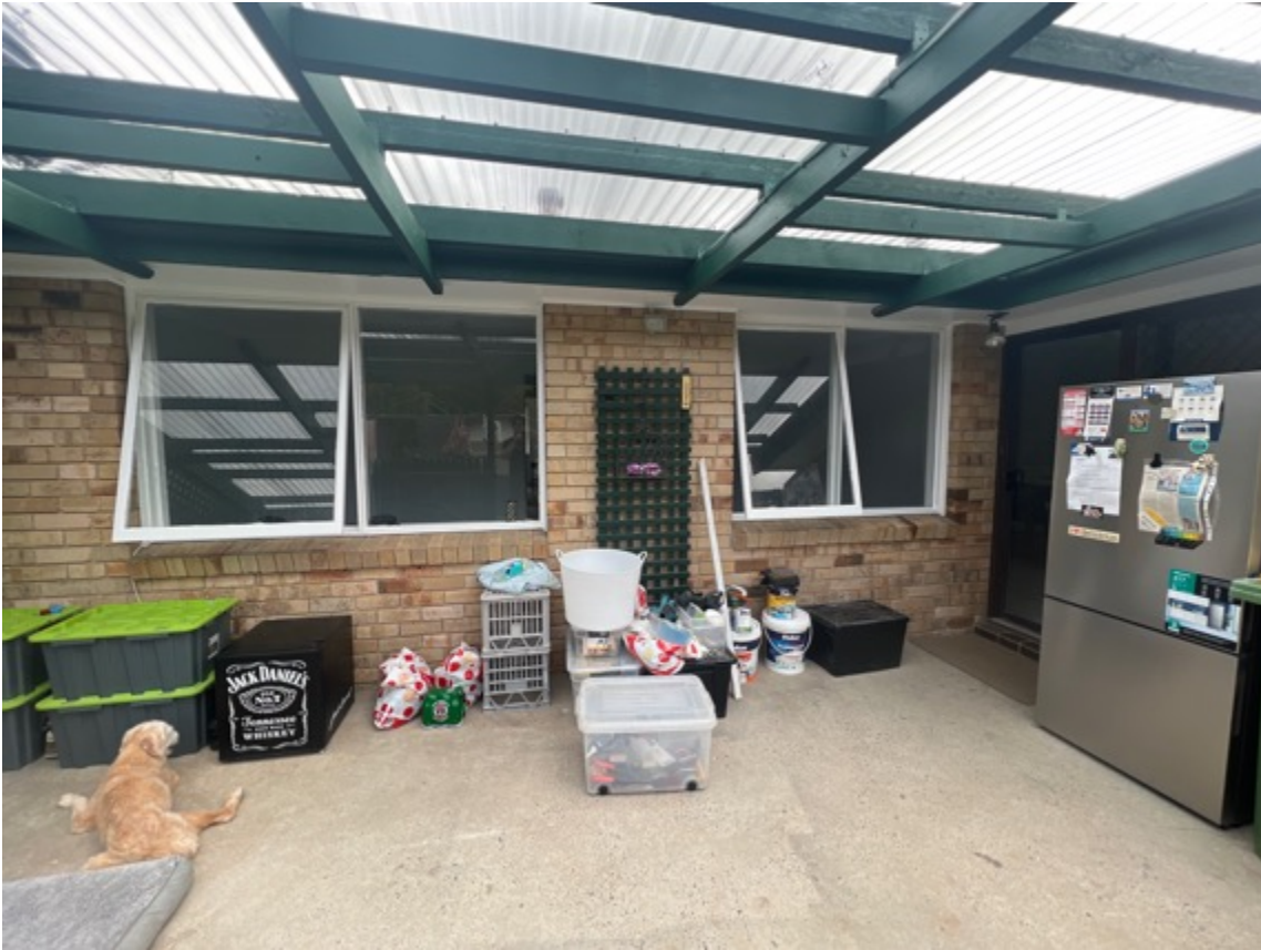
Rear elevation example above.