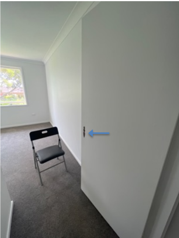
The main bedroom door hardware is missing.