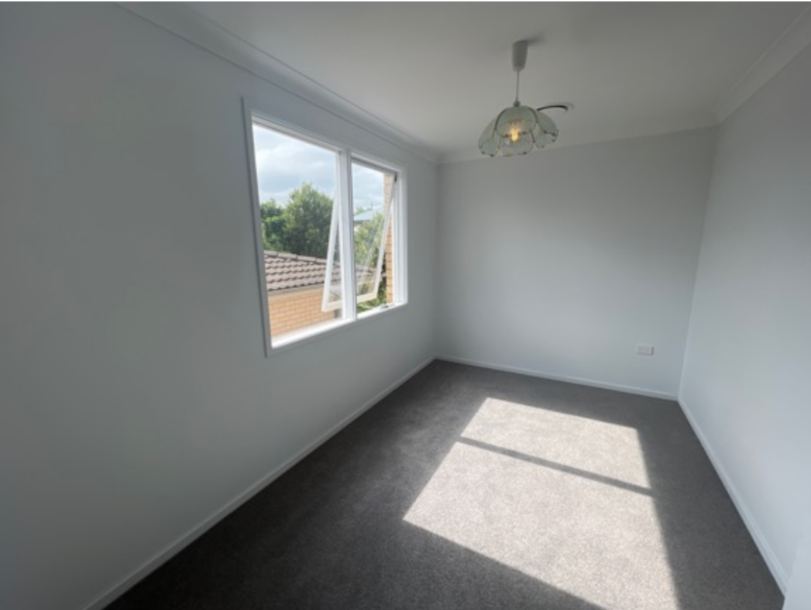
Example rear dining room above.