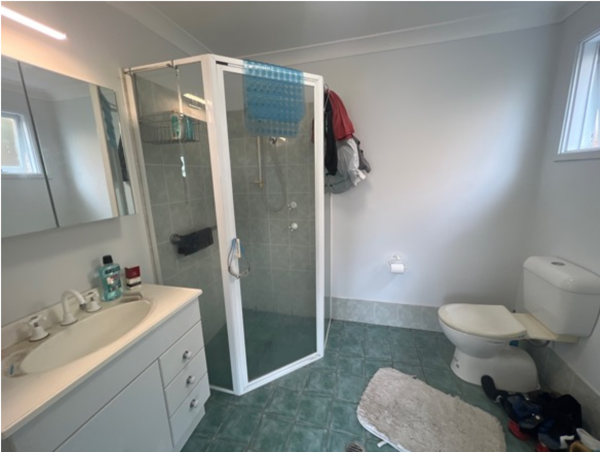
The ensuite bathroom is in serviceable condition.