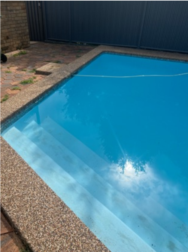
External pavers are in serviceable condition, minor sections are undulating. Minor sections of the pool interior are worn.