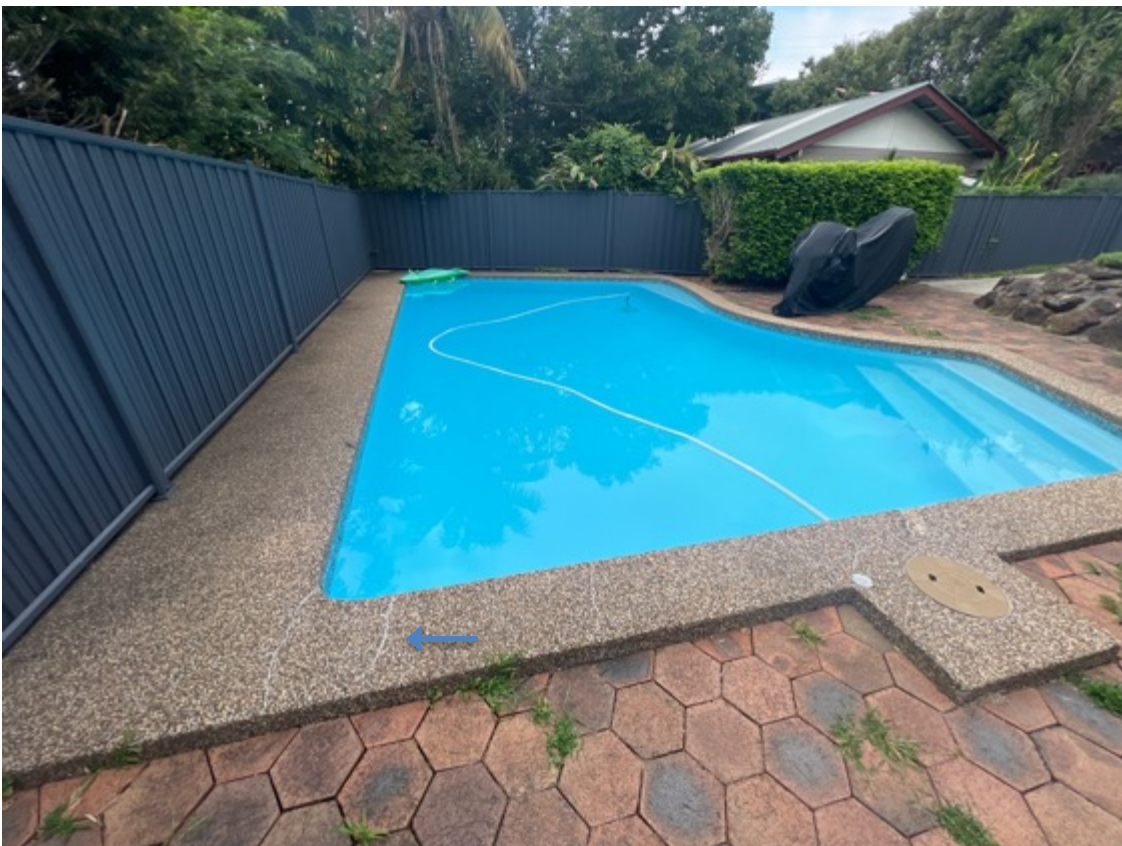
Minor sections of pebblecrete are cracked.