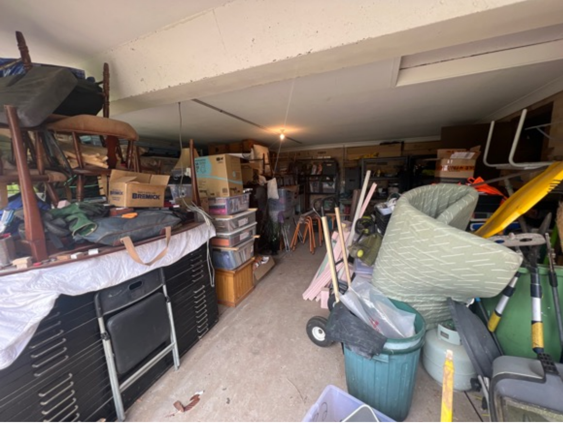
The garage is in serviceable condition - sections of the visual inspection zone are blocked due to stored goods.