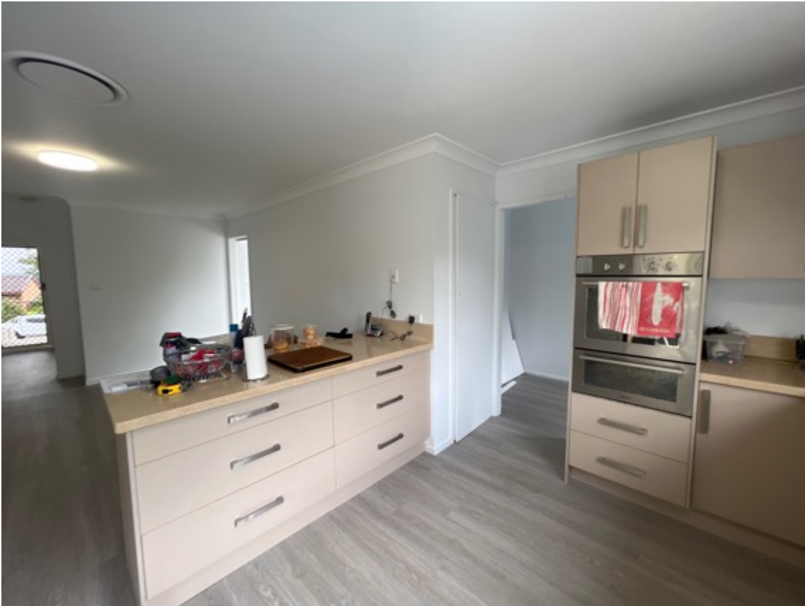
Cupboards and draws tested, function as intended (minor sections display low level wear, typical for the age.)