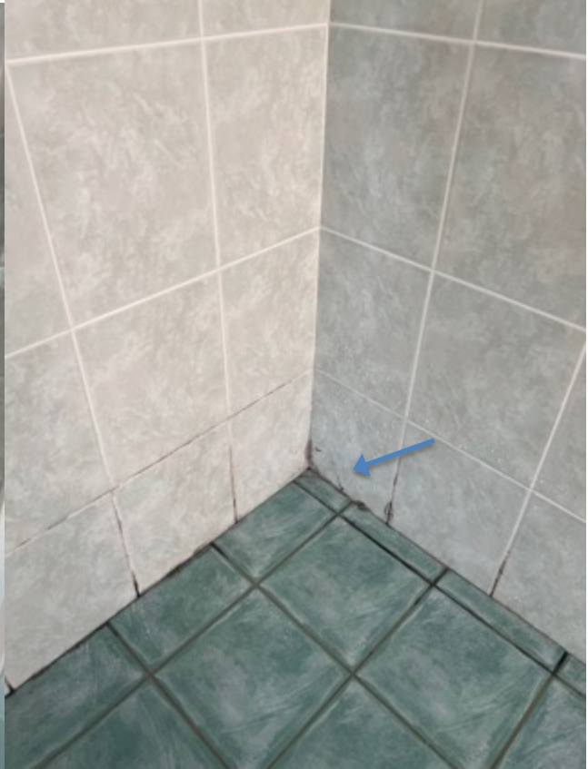
One wall tile is cracked here.