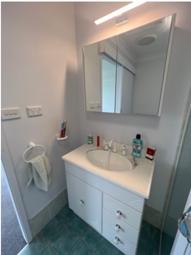
Sub-sink drainage checked was leak free at the time of inspection - taps display minor corrosion.