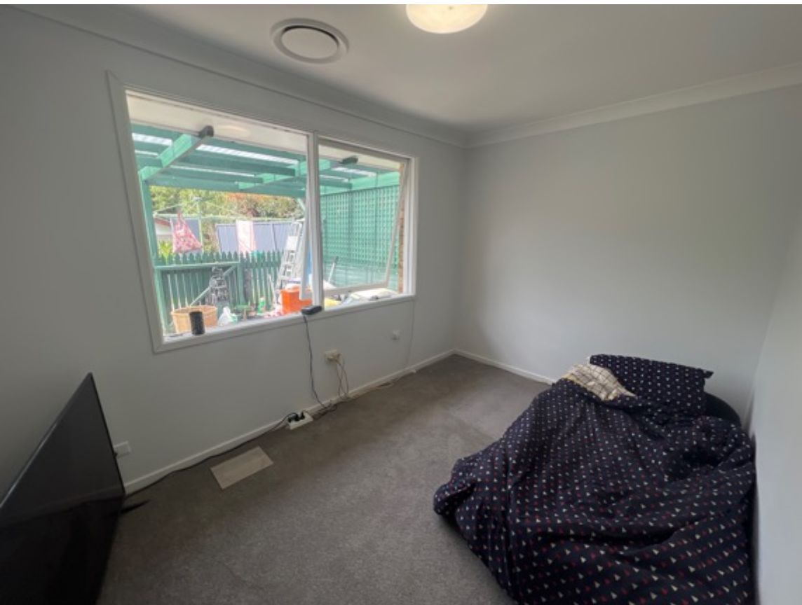
Example rear right side bedroom.