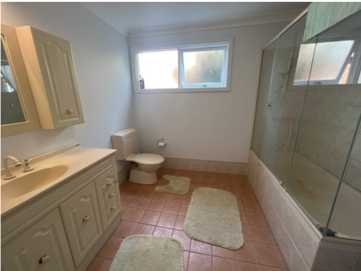
The common bathroom area tested for leaks, was issue free at the time of inspection.