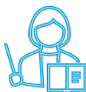
Meadowglen Primary School