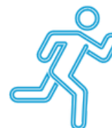
Winchester Park Playground