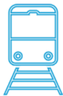
Epping Station (Mernda Line)