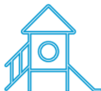
Foothills Park Playground