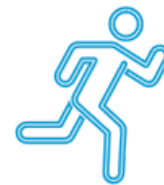
Middle Gorge Park (Parks Victoria)