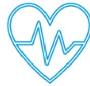
Active Medical Caroline Springs