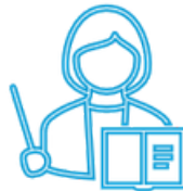
St Luke's Primary School