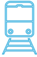
Lalor Station (Mernda Line)