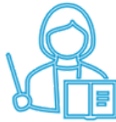
St John XXIII Primary School