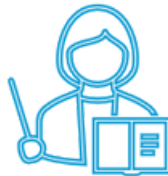
St Luke's Primary School