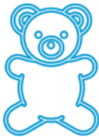
Me For Kids Thomastown Learning Centre