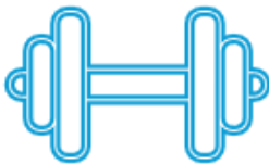
Thomastown Recreation & Aquatic Centre