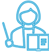
St Clare's Primary School