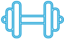
The Fitness Workshop - Lalor Gym