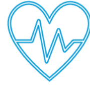
Heidelberg West Medical