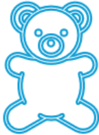
Audrey Brooks Preschool