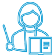
St George Preca Primary School